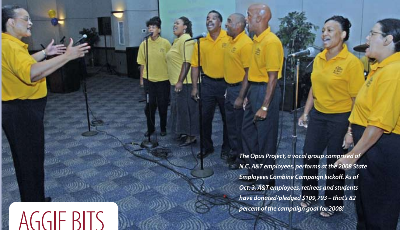
The Opus Project, a vocal group comprised of N.C. A&T employees, performs at the 2008 State Employees Combine Campaign kickoff. As of Oct. 3, A&T employees, retirees and students have donated/pledged $109,793 – that's 82 percent of the campaign goal for 2008!